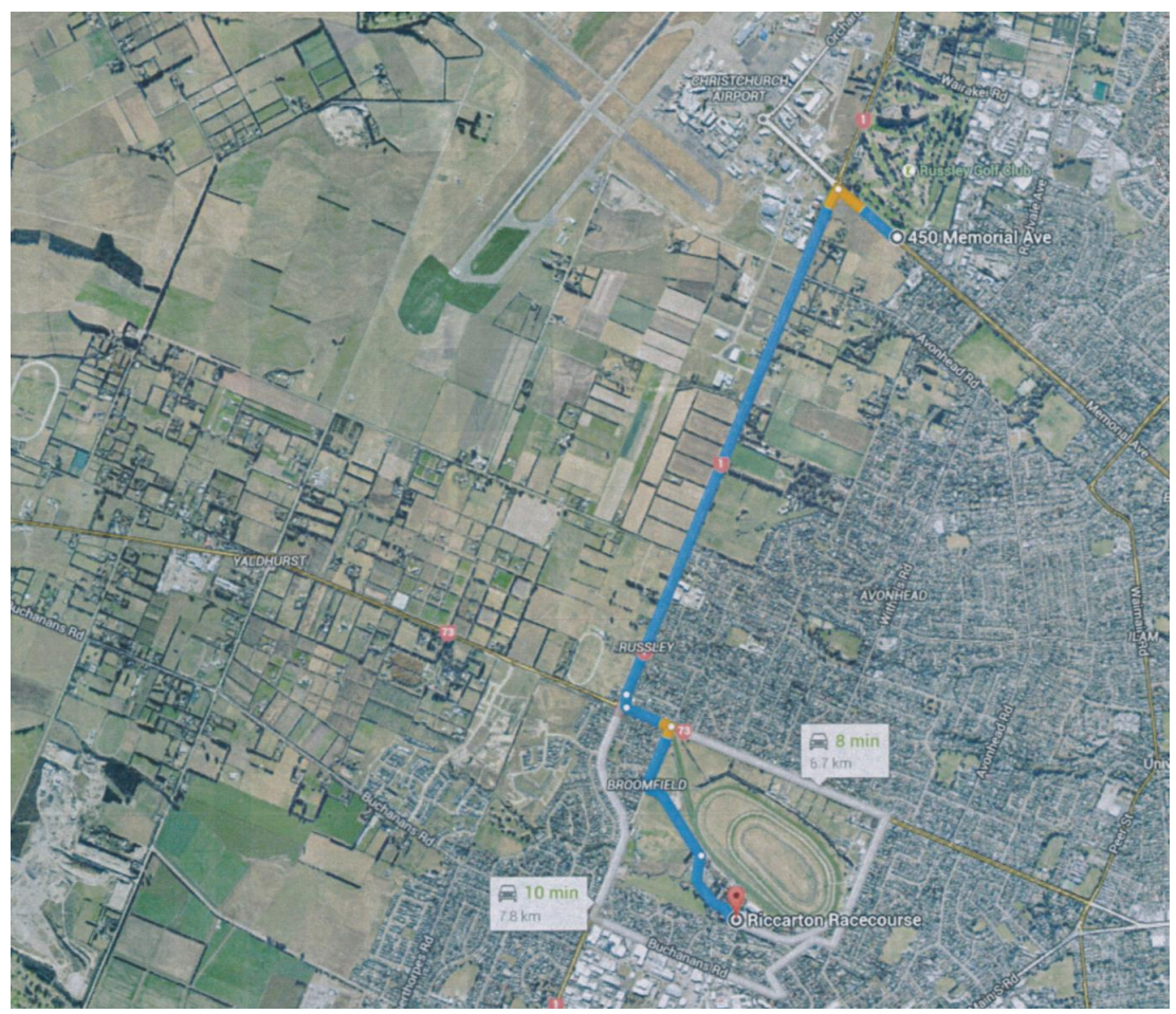
Fig 2: Venue location from Commodore Hotel